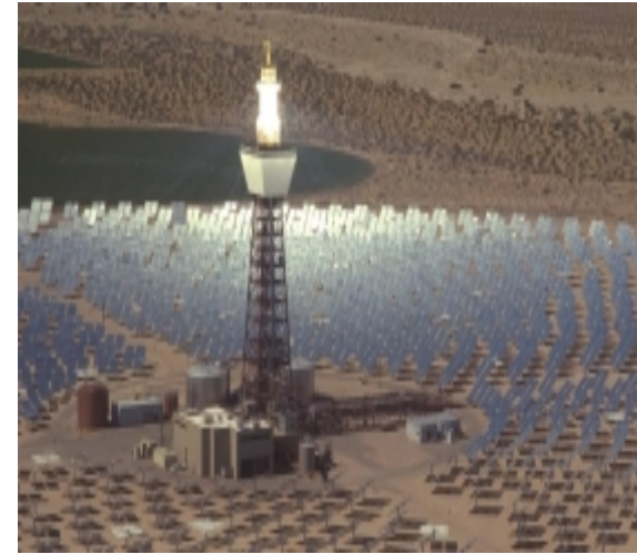
Solar Power Tower